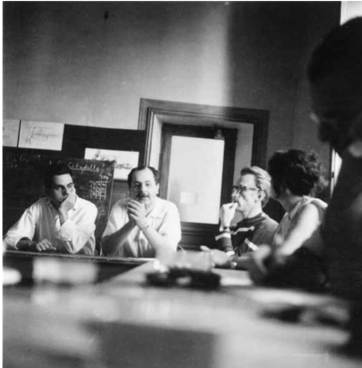
FIG. 4 STEFAN WEWERKA, GEORGES CANDILIS, OSKAR HANSEN AND ALISON SMITHSON IN BAGNOLS-SUR-CÈZE, 1960

Adriatic and the Baltic Seas in the wake of the First World War. 16 This included avant-garde architectures, and in the contested territories of Central Europe after the First World War, such as Moravia and Silesia, modern architecture was interpreted as a rupture with the past and an embodiment of the new nation-states. This national dimension is very present in the Linear Continuous System, the urbanization model proposed by Oskar Hansen for socialist Poland. The four strips of urbanization suggested by Hansen were intended to link up the country and integrate the territory of the new state, whose borders had shifted west following agreements between the victors of the Second World War. This relationship between modern architecture and nation-building became particularly relevant for those architects from Central Europe who, like Polónyi, were designing in postcolonial states faced with the challenge of nation-building in territories that were characterized by ethnic divisions and culturally dependent on their former colonizers.