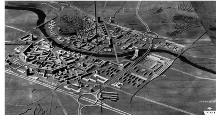
FIG. 3 JOHANNES VAN DEN BROEK AND JAAP BAKEMA, MASTERPLAN OF THE CITY OF SKOPJE, COMPETITION ENTRY, 1965