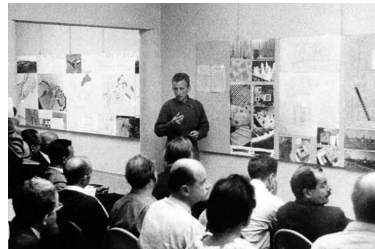
FIG. 1 OSKAR HANSEN DURING HIS PRESENTATION IN OTTERLO, 1959